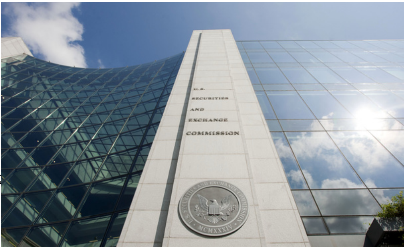
SEC headquarters in Washington.

(http://www.thinkadvisor.com/2018/06/25/sec-issues-updated-faq-on-custody-rule/)